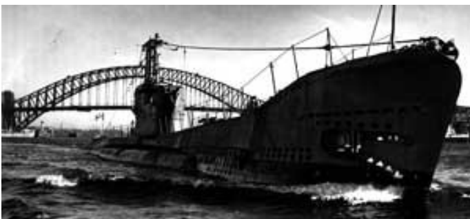
HMS Amphion in Sydney Harbour

On commissioning of HMAS PLATYPUS on 18 August 1967, Royal Australian Navy Submarine Squadron was established. It consisted of HMAS OXLEY, HMS TABARD and HMS TRUMP and replaced the Royal Navy's Fourth Submarine Squadron (SM4).